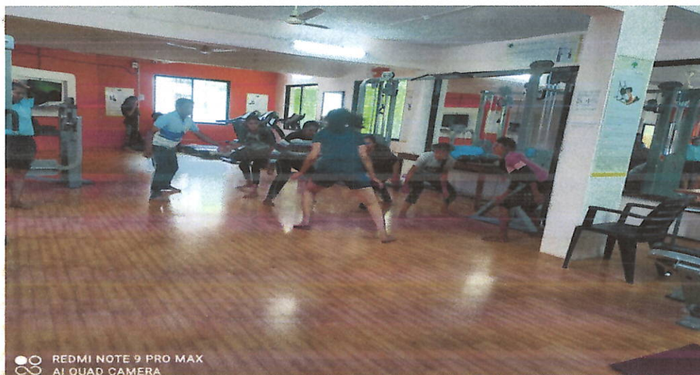
Kabaddi Skill Practice