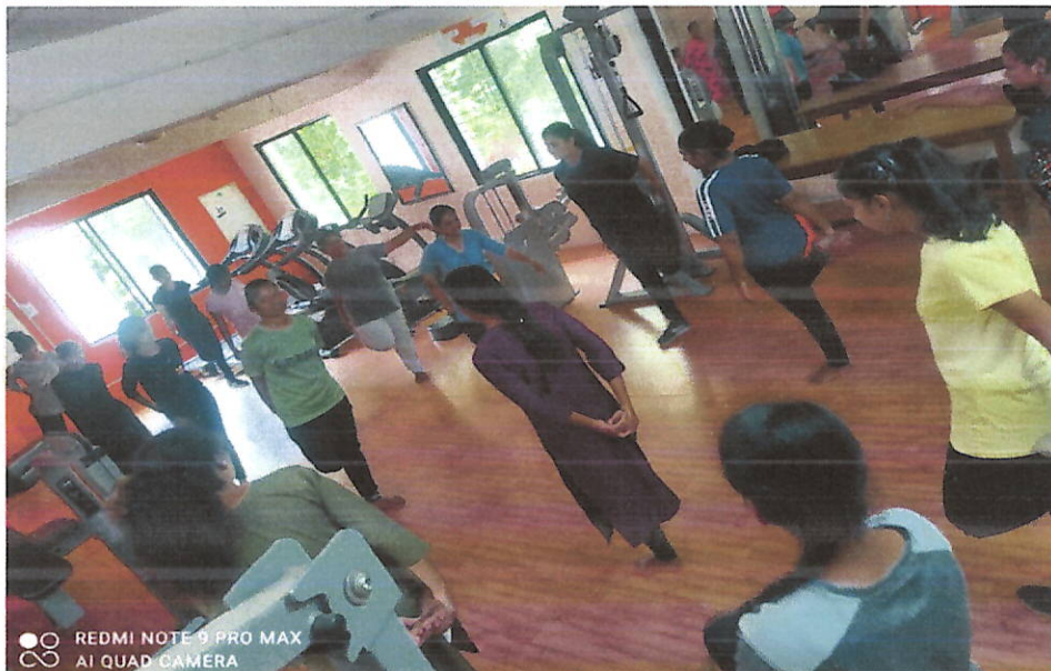
Warm up exercise